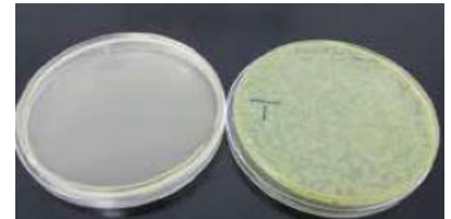
Challenge with 108cfu/ml P.a. (ATCC No. 15442) Swabbing (16 hrs. after contamination)